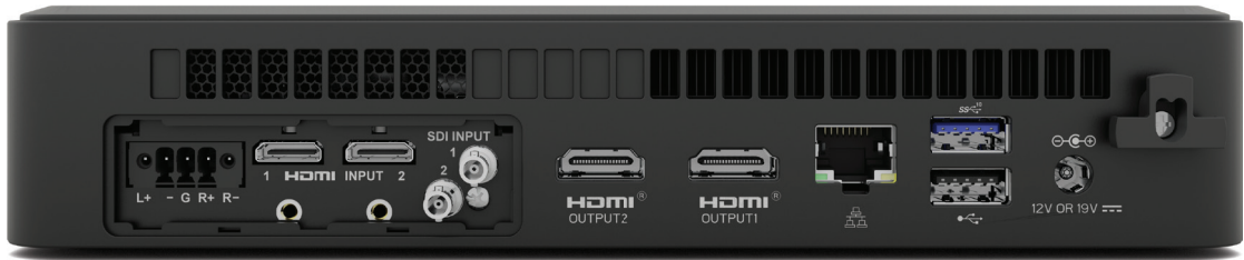
Matrox Vion EX (back view)

Input baseband, IPMX, NDI, and SRT, and cross-convert streams concurrently with simultaneous output. Increase productivity and throughput by processing multiple inputs at the same time. Mix and match output formats and protocols to deliver the right content the right way.